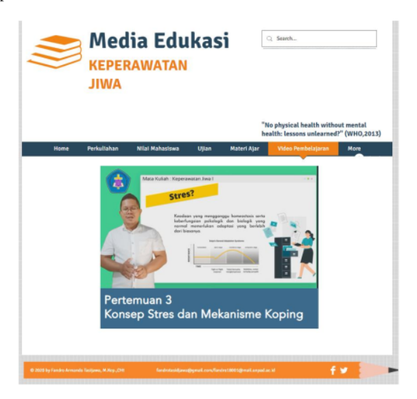
Figure 2. One of the learning videos at the 3<sup>rd</sup> meeting of the mental health nursing course

The website "Media Edukasi Keperawatan Jiwa" consists of several menus such as lectures, student grades, examination, teaching materials, learning videos, and member areas that can be accessed through laptops or smartphones. The learning video menu becomes a learning innovation during the Covid-19 pandemic because the students can learn independently by playing videos repeatedly to understand these materials (Stuckey & Wright, 2020). Other menus are set to ease students in the lecture process. Also, the lecturer can set up when the information is published, activate/disable the link, and set a password for a particular class.